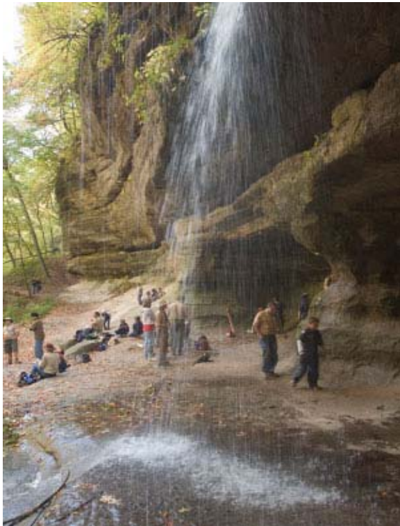
October 2006 – Pack 110, Starved Rock State Park, IL

So why did your son want to join scouting...he wanted to do out-of-door stuff, hike, camp, explore the out-of-doors .